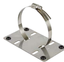
Mounting Bracket & Plate included for MS320P