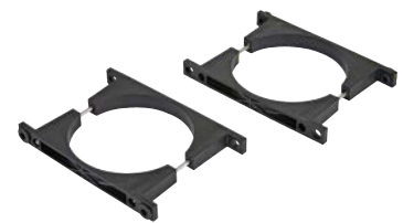
Mounting Bracket included for MS580P, MS900P and MS1200P